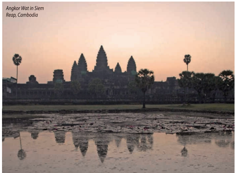
Angkor Wat in Siem Reap, Cambodia

Last year, Thailand's Democrat Party-led coalition