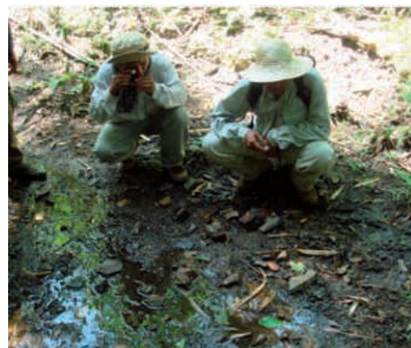
Brighton Mining is exploring in Cambodia

The focus in Cambodia, the least developed mining sector of Indochina, has been gold exploration with Australian companies Indochine Mining Ltd and Oz Minerals Ltd leading the way.