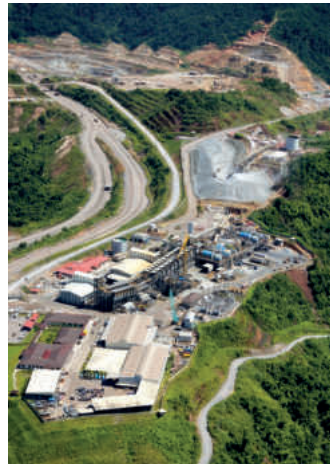
Aerial view of the Phu Kham mine

The moratorium on any new mining investments continues, but the government still allows land sur-