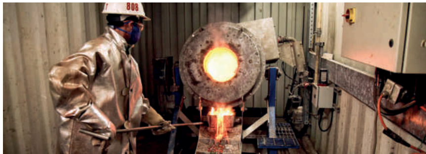
Canadian gold miner Besra Gold holds more than 80% of the shares in Vietnam's two largest gold mines

State-owned Vietnam Coal & Minerals Industries (Vinacomin) controls Vietnam's coal sector and is responsible for nearly 95% of the country's coal pro-